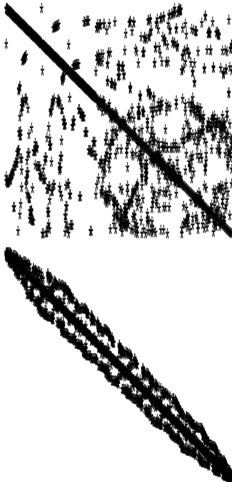
Figure 2 Sparsity of the matrix before (top) and after (bottom) the renumbering